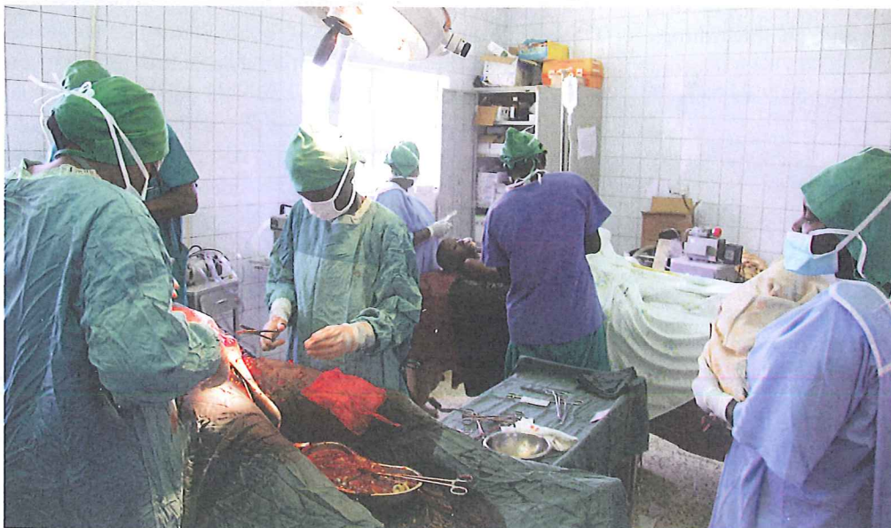
One O.R., two tables, two patients, two surgeries. Soroti District Hospital, Uganda.