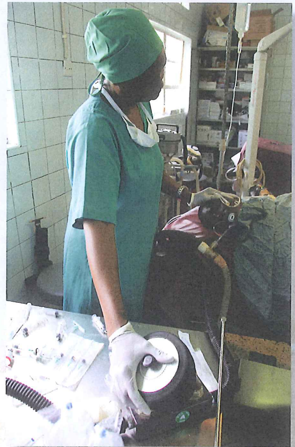
OMV and EMO are used in an intubated patient (note no monitors, just a finger on the temporal artery). Soroti District Hospital, Uganda.

More information can be found at www.GlobalPAS.org or through email at partners@GlobalPAS.org .