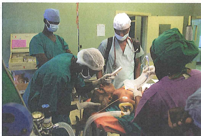
A new Ugandan resident on his first day in the O.R. supervised by a recently graduated Ugandan anesthesia attending (GPAS-AAGBI scholar).

GPAS was formed in 2007 at the University of California, San Francisco (UCSF) from an existing collaboration between UCSF and Makerere University (MU) in Kampala, Uganda. The original UCSF-MU partnership focused on trainee and faculty