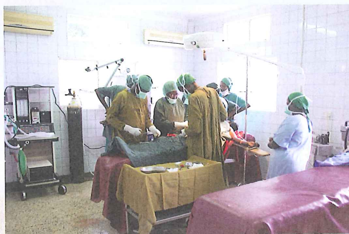
O.R. with two tables at Soroti District Hospital in Uganda (note "new" machine pushed into a corner, unused).

Based on these concerns, a task force formed and adopted the name GPAS. This multi-national, multi-disciplinary group included anesthesia, surgery and emergency medicine representation from both UCSF and MU.