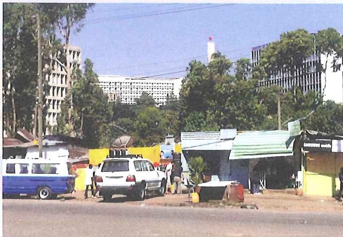
The Blacklion Hospital in Addis Abeba, Ethiopia.

Volunteers teach anesthesia in a structured master's-level nurse anesthesia program. Volunteers supervise trainees in the hospital and provide lectures in a well-structured and coordinated curriculum in anesthesia.