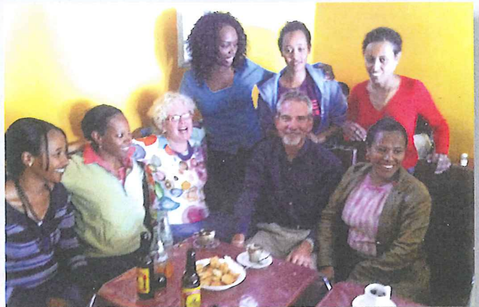
Three HVO volunteers with a group of nurse anesthesia students who we taught, in a café in Addis Abeba.

HVO currently has anesthesia sites in Ethiopia, Malawi, Peru, Viet Nam, India and South Africa. Anesthesiologists are invited to join HVO and volunteer to travel to these sites to