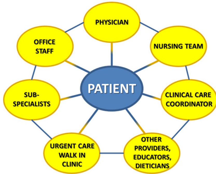
Patient-Centered Medical Home Team