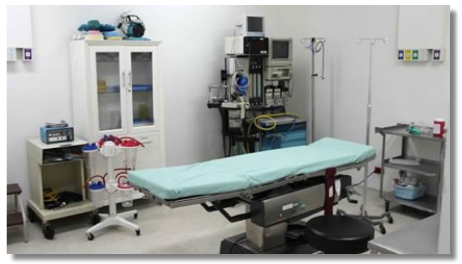
One of three O.R.s available at the Moore Pediatric Surgery Center, with equipment similarly found in the U.S.

Recently, a team of Vanderbilt physicians, nurses and surgical scrub technicians spent six days at the Moore Pediatric Surgery Center in Guatemala City, providing ENT services to 79 children and adolescents. Annually, Vanderbilt sends two surgical teams to the Moore Center, covering several specialties in great demand, including ENT, plastics, orthopedics and urology. During the recent trip, the otolaryngologists screened 106 patients in the preoperative clinic to evaluate them for potential surgery. The screened patients were then evaluated by the physician anesthesiologists in preparation for surgery. Once cleared for surgery, patients were scheduled over the following five days. Surgical procedures included adenotonsillectomy, airway evaluations for subglottic stenosis, and tympanoplasty, among others.