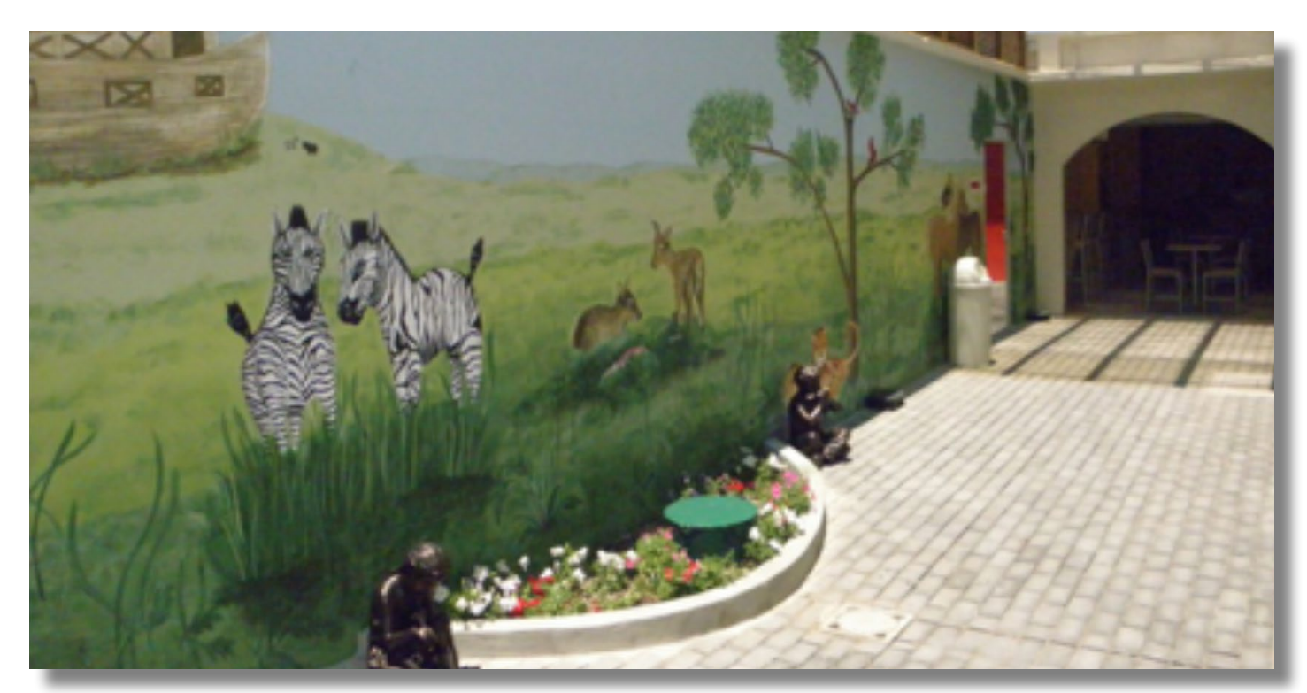
Moore Center Courtyard and café, where families can wait and children can play.